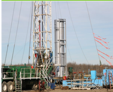
Well Testing & Flowback Alberta, Canada