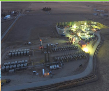
Early Production Facility Colorado, United States