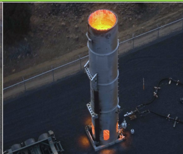
Pipeline Blowdown & Maintenance California, United States