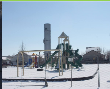
Community Acceptance Colorado, United States